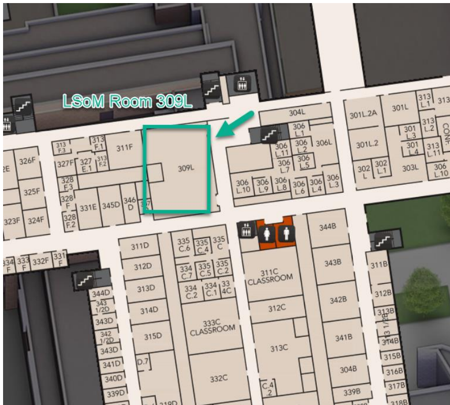
LSOM Room 309L