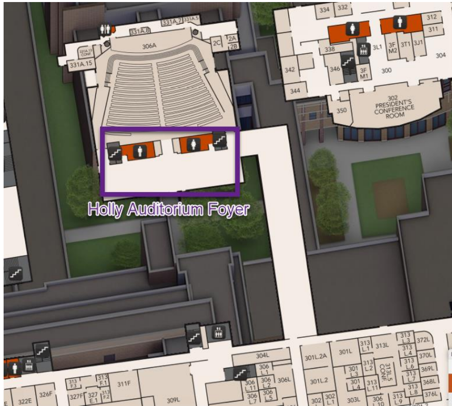
Holly Auditorium Foyer